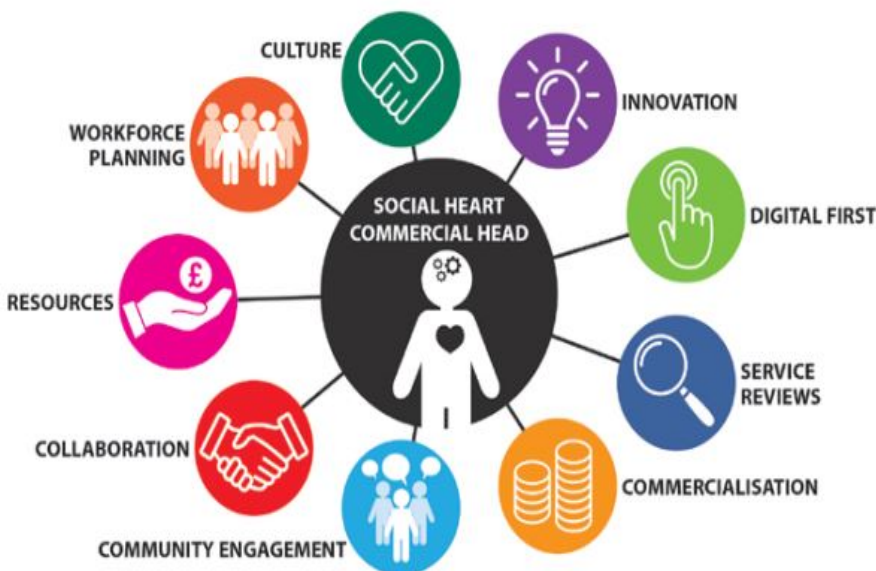
Exhibit 2: the transformation strategy, #Team Caerphilly – Better Together

Source: Caerphilly CBC, Corporate Plan 2018-23, Revised and Updated for 2019-20