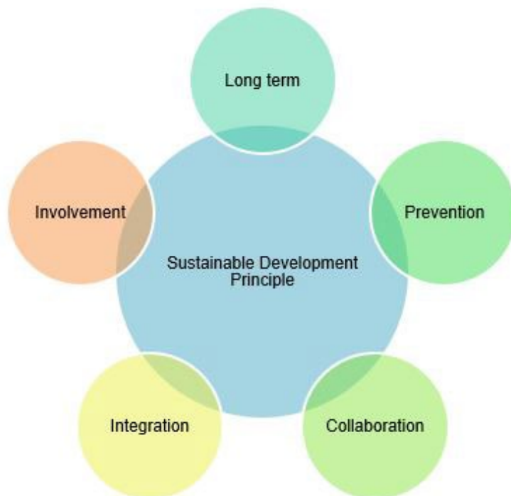
Exhibit 1 – the sustainable development principle and the five ways of working